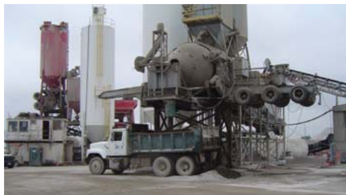
Fig. 3: Double central-mix batch plant at the Union Pacific Intermodal facility in Hutchins, TX